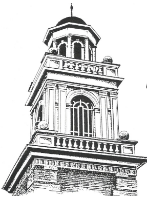
ST. PAUL UNITED CHURCH OF CHRIST Wapakoneta, Ohio